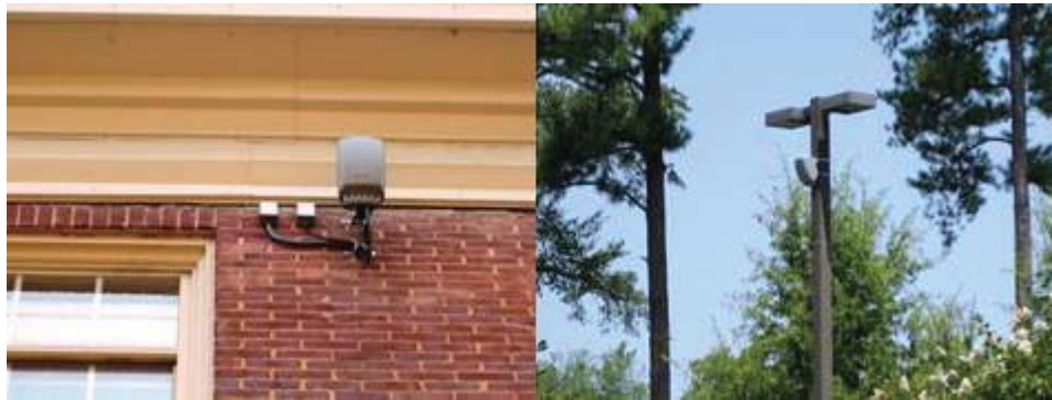
Figure 2. BelAir Networks compact, robust outdoor Wi-Fi nodes provide high-performance coverage indoors and outside while blending in to the college environment.